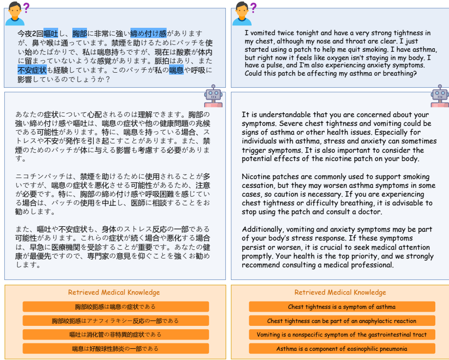
Fig. 2. English translation and the full content of the question and answer in the Fig. 1